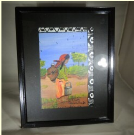
Girl Fetching Water 22 x 27cm