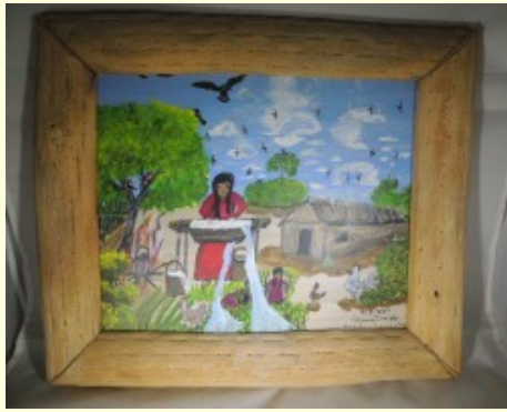
Household chores 38 x 33cm