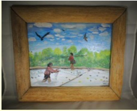
Wichi Painting in Cactus Frame